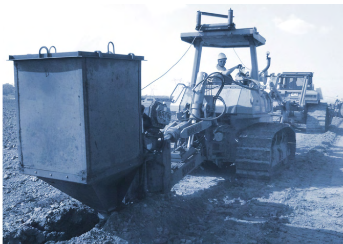
Plowing in an AC Mitigation system along a pipeline right-of-way