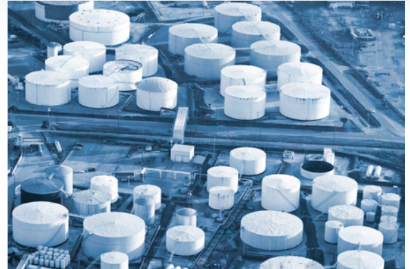
Dense tank farms present major grounding challenges