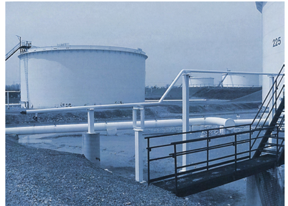
Closer view of storage tanks and associated infrastructure