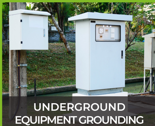
UNDERGROUND EQUIPMENT GROUNDING