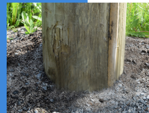
BACKFILL & TAMP

For superior performance ConduCrete conductive backfill can further reduce ground resistance!