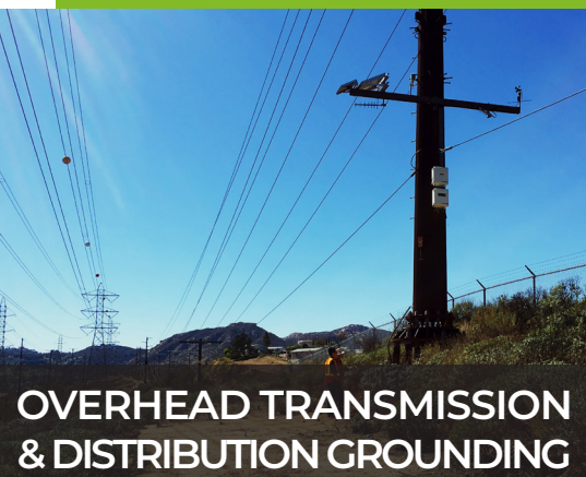
OVERHEAD TRANSMISSION & DISTRIBUTION GROUNDING