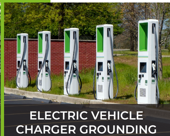
ELECTRIC VEHICLE CHARGER GROUNDING